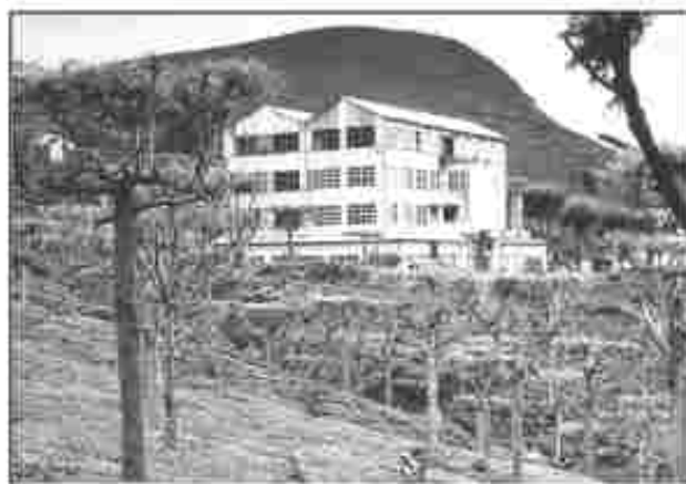
Fig. 5.5: Tea Garden and a Tea Factory in the Nilgiri Hills of Tamil Nadu

Agro processing includes canning, producing cream, fruit processing and confectionery. While some preserving techniques, such as drying, fermenting and pickling, have been known since ancient times, these had limited applications to cater to the pre-Industrial Revolution demands.