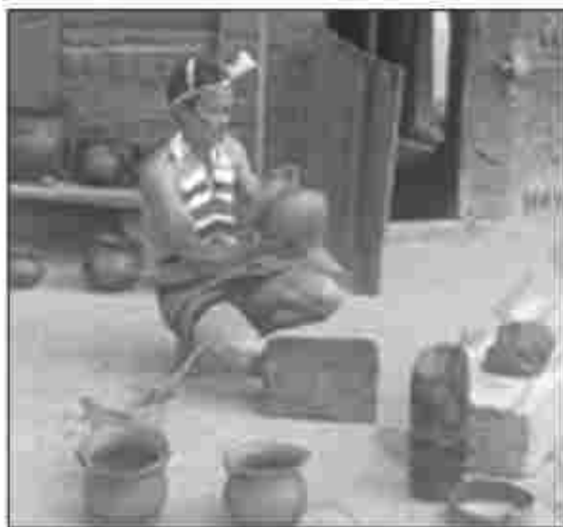
Fig. 5.2 (a) : A man making pots in his courtyard, example of household industry in Nagaland

It is the smallest manufacturing unit. The artisans use local raw materials and simple tools to produce everyday goods in their homes with the help of their family members or part-time labour. Finished products may be for consumption in the same household or, for sale in local (village) markets, or, for barter. Capital and transportation do not wield much influence as this type of manufacturing has low commercial significance and most of the tools are devised locally.