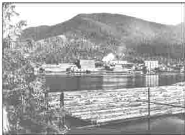
Fig. 5.6: A pulp mill in the heart of the Ketchikan's timber area of Alaska

The forests provide many major and minor products which are used as raw material. Timber for furniture industry, wood, bamboo and grass for paper industry, lac for lac industries come from forests.