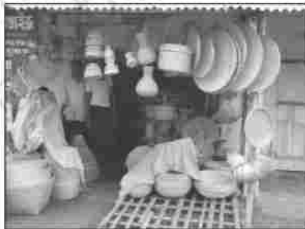
Fig. 5.3: Products of cottage industry on sale in Assam

Small scale manufacturing is distinguished from household industries by its production techniques and place of manufacture (a workshop outside the home/cottage of the producer). This type of manufacturing uses local raw material, simple power-driven machines and semi-skilled labour. It provides employment and raises local purchasing power. Therefore, countries like India, China, Indonesia and Brazil, etc. have developed labour-intensive small scale manufacturing in order to provide employment to their population.