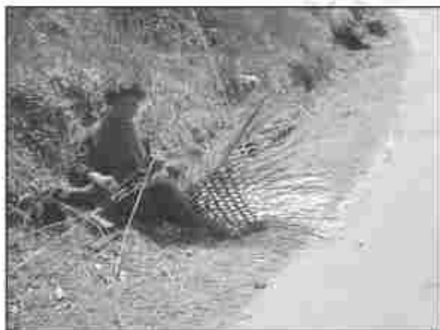
Fig. 5.2 (b) : A man weaving a bamboo basket by the roadside in Arunachal Pradesh

Some common everyday products produced in this sector of manufacturing include foodstuffs, fabrics, mats, containers, tools, furniture, shoes, and figurines from wood lot and forest, shoes, thongs and other articles from leather, pottery and bricks from clays and stones. Goldsmiths make jewellery of gold, silver and bronze. Some artefacts and crafts are made out of bamboo, wood obtained locally from the forests.