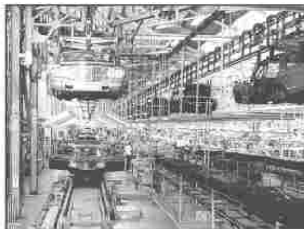
Fig. 5.4 : Passenger car assembly lines at a plant of the Motor Company in Japan